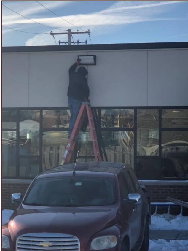
Installing the outside lighting.