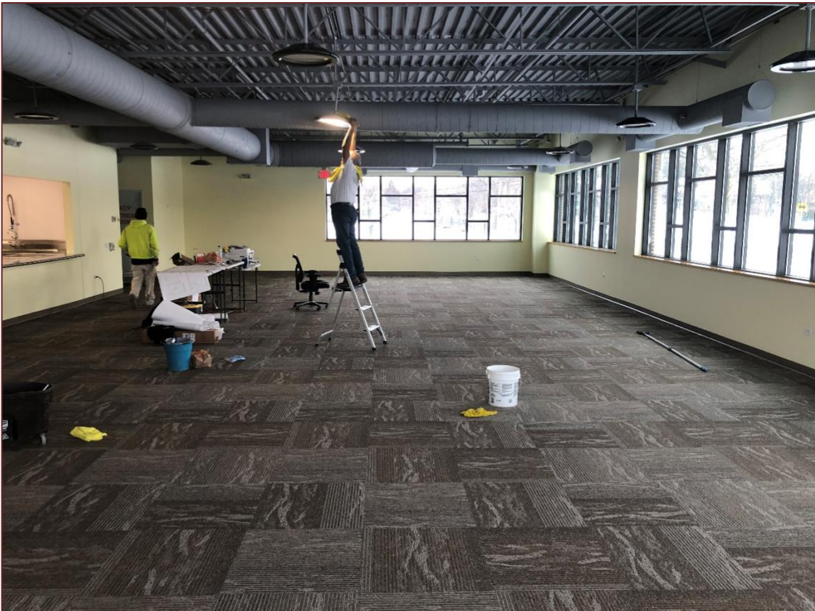
The Township Room.