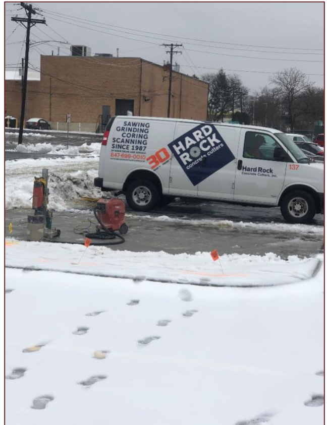
Working on the trash enclosure.