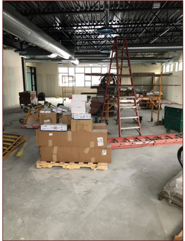
Main rooms to be cleaned before painting begins.