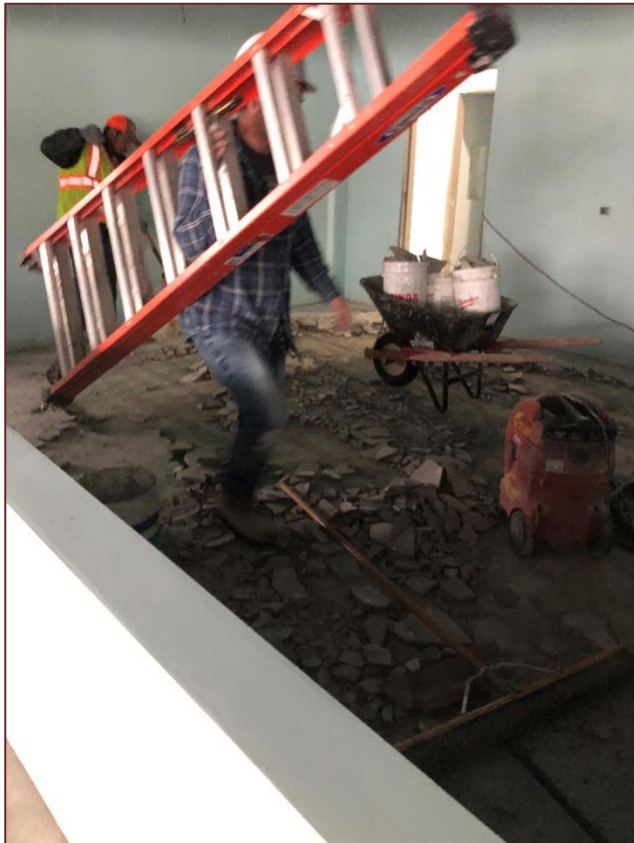
Working on the kitchen floor.