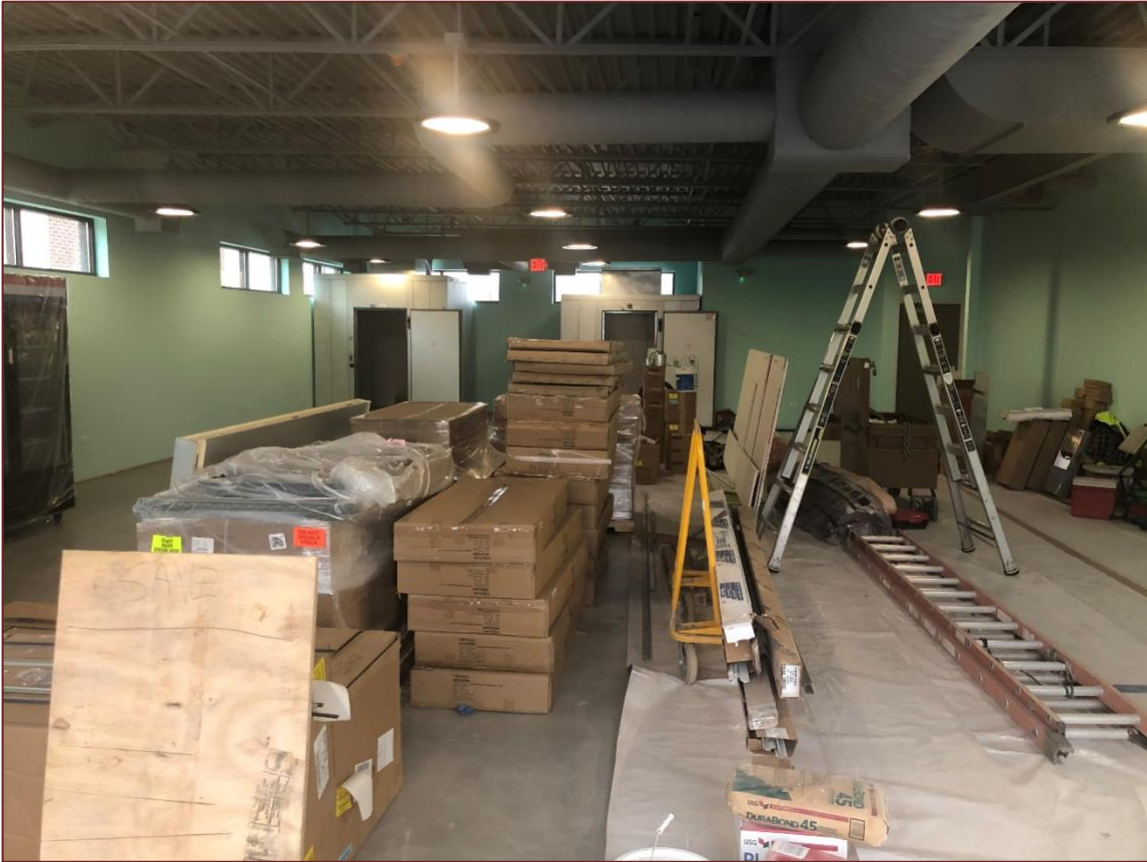
The Food Pantry.