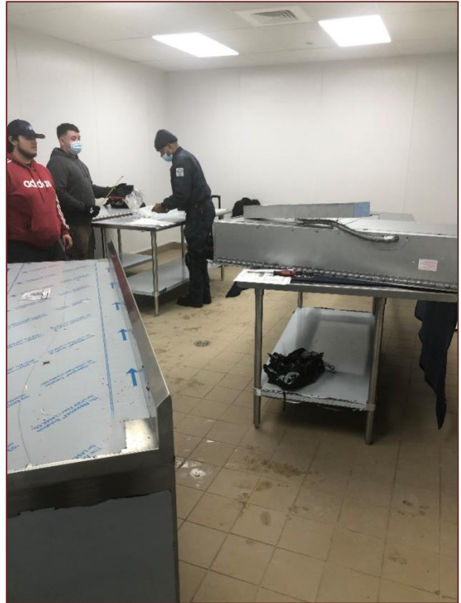
Work in the kitchen.