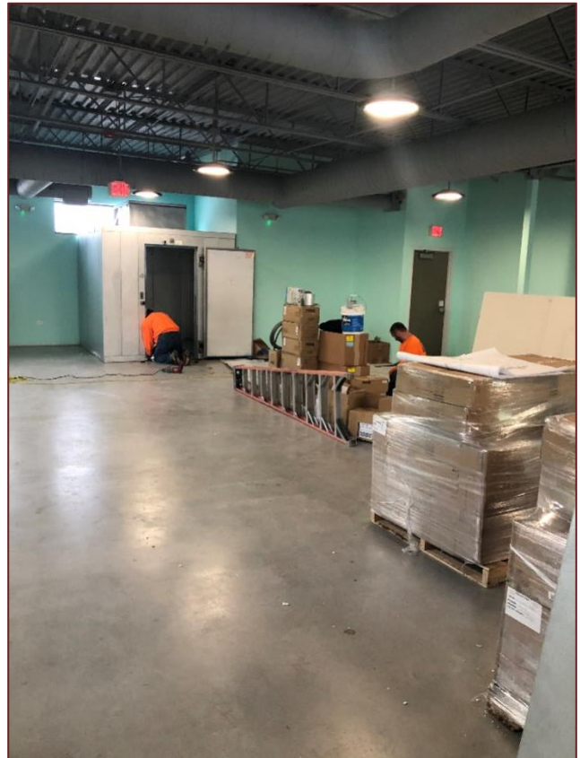
Working on the refrigeration units.