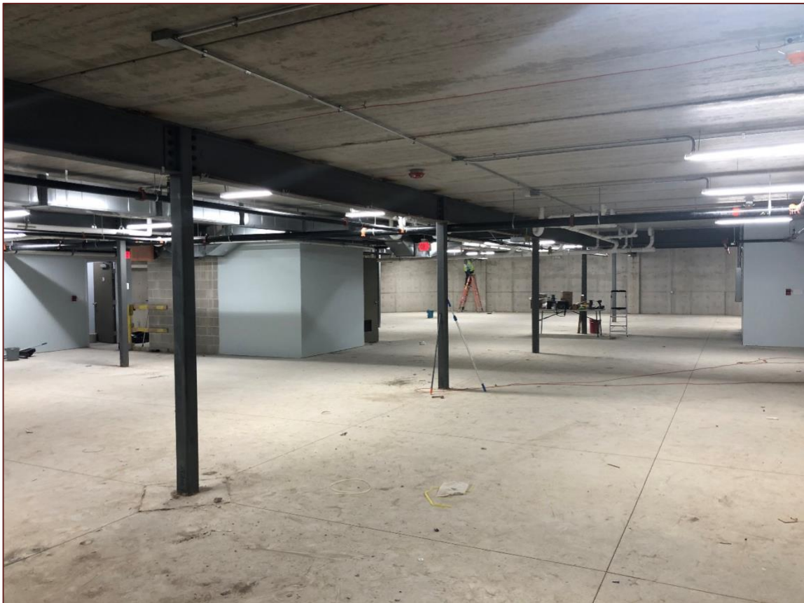
Cleaning the Basement.