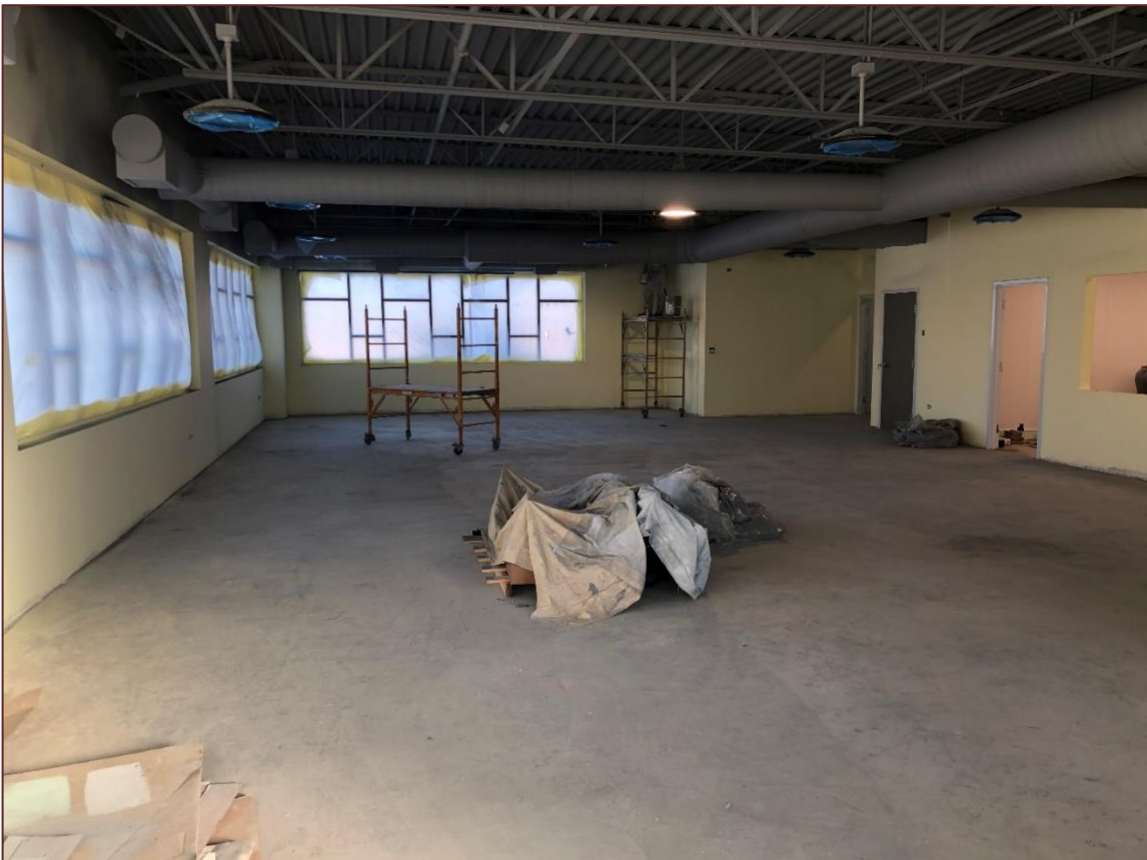
The Township Room.