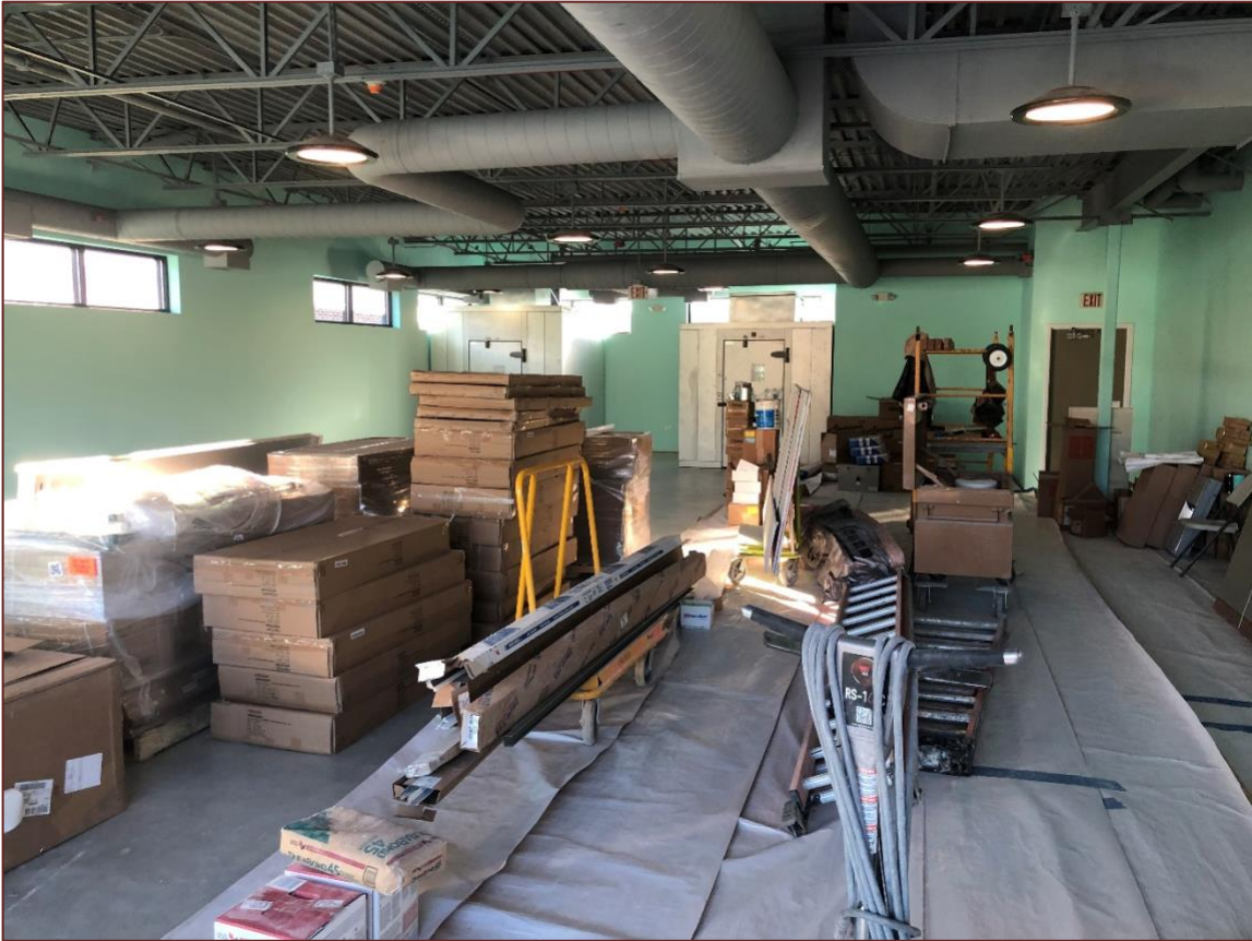
The Food Pantry.