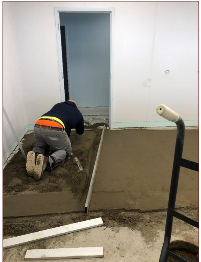
Repairing the Kitchen Floor.