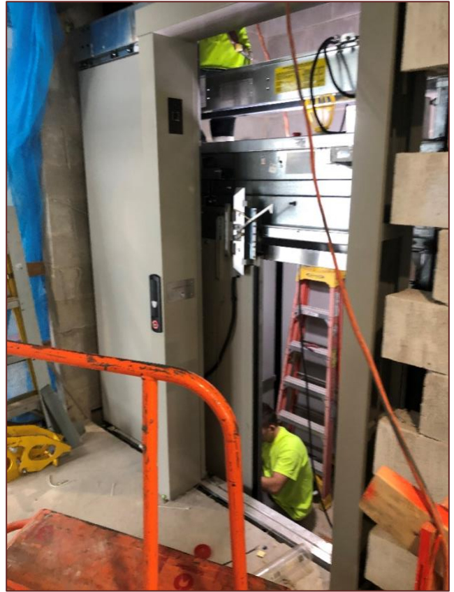
Working on the elevator.