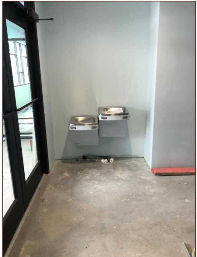
The Hallway and the Drinking Fountains.