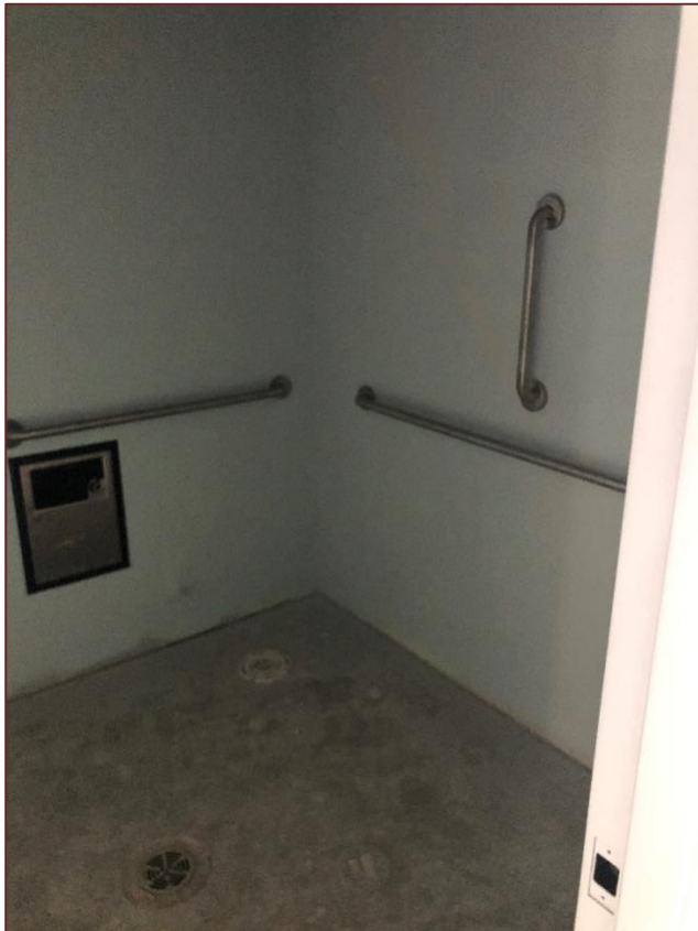
Work in the bathrooms.