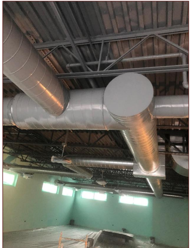
Painting the ceiling in the Food Pantry.