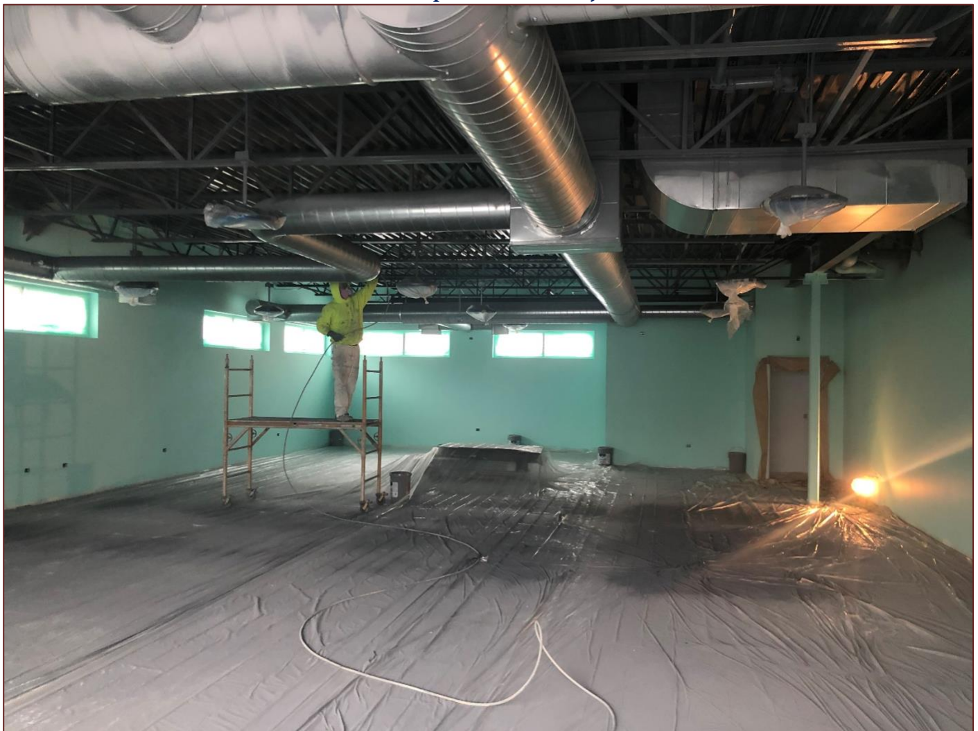
Painting the ceiling in the Food Pantry.