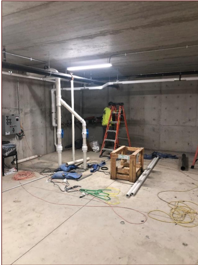
Connecting the Fire Safety System.