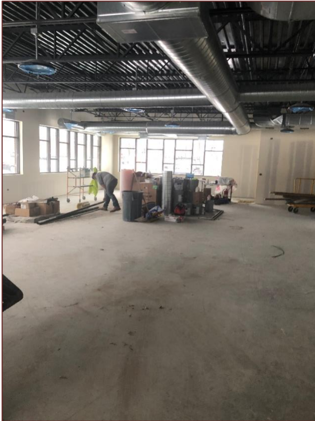
Cleaning up the Township Room.