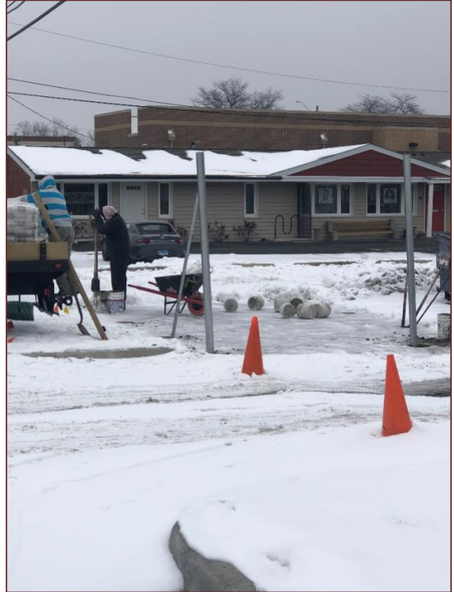
Fencing the Trash Corral.