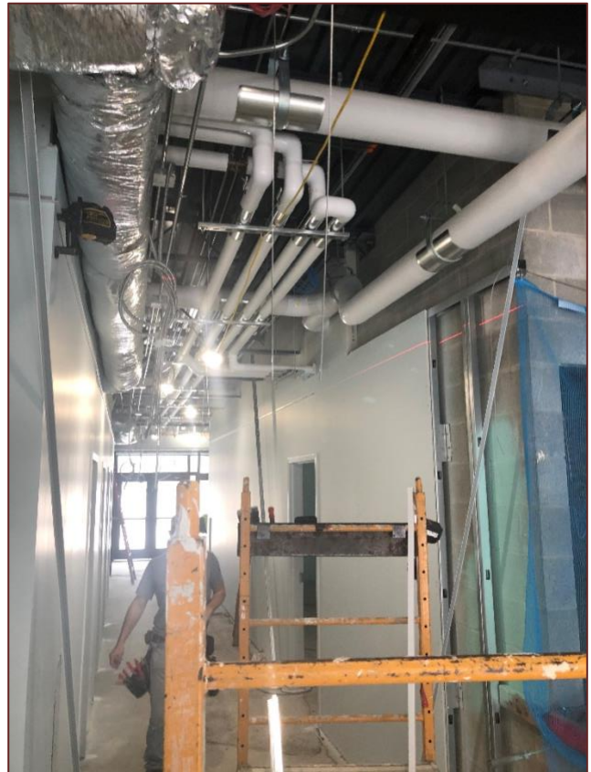
Setting the ceiling grid in the hallway.