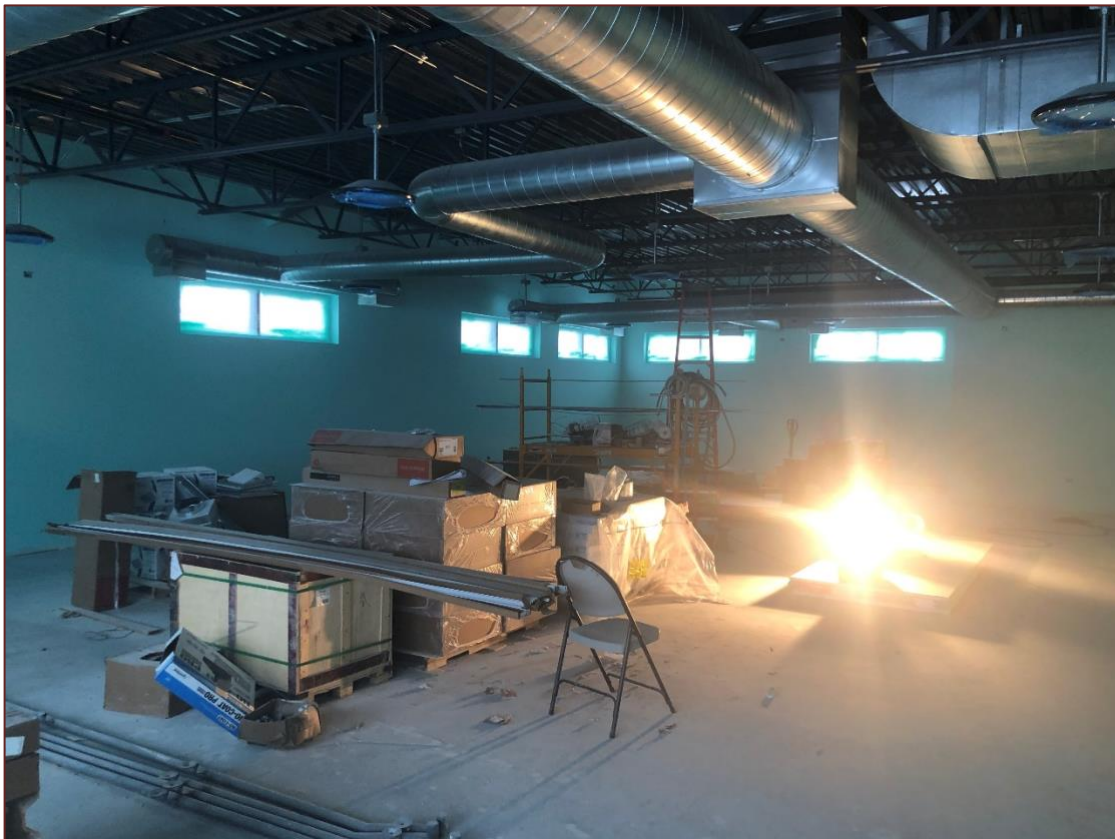
Painting in the Work Room.