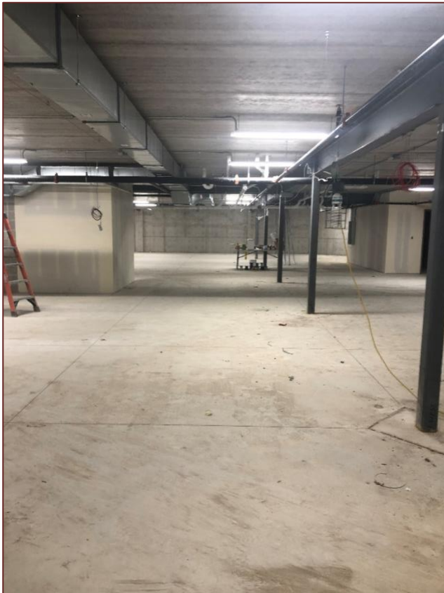
Cleaning the basement.