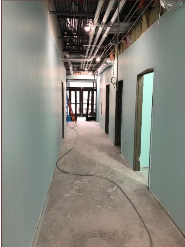
Painting of the hallway.