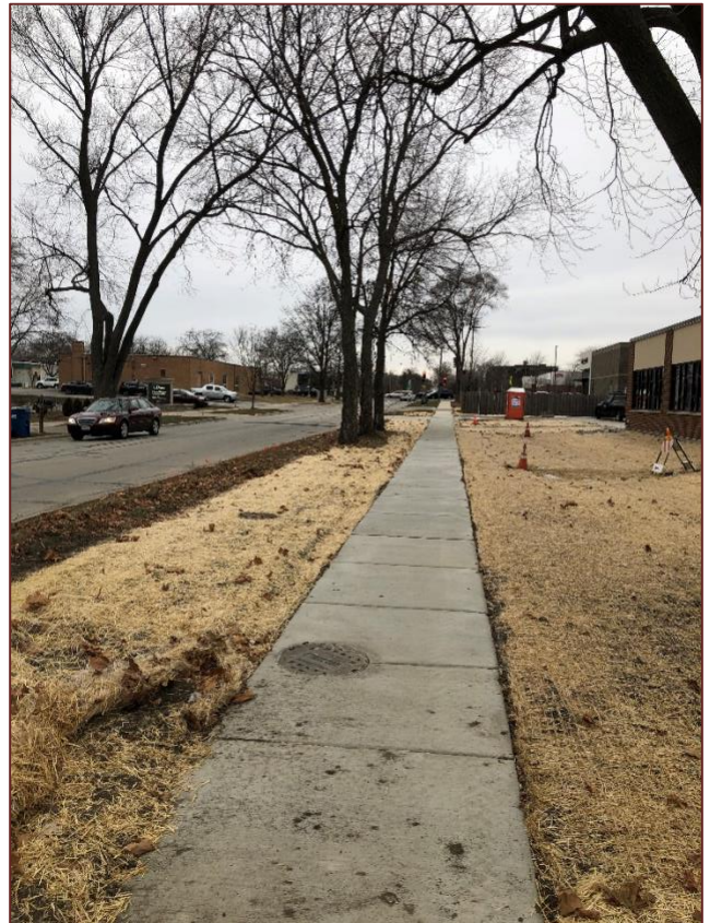
Construction fences are removed.