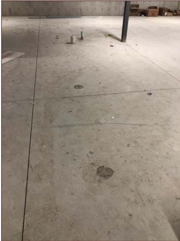
Basement Floor Drains.