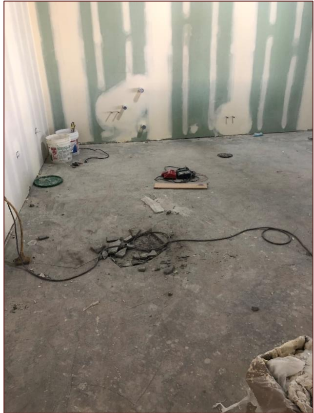
Kitchen Floor in need of repairs.