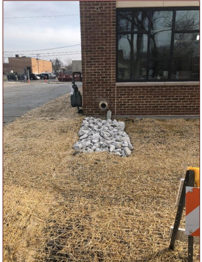
The River Rock. Great energy dissipater.