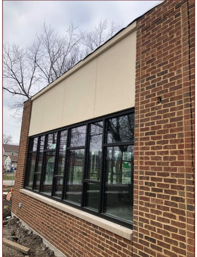
Working on the EIFIS.