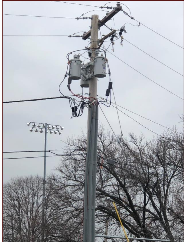
Com Ed meter is in.