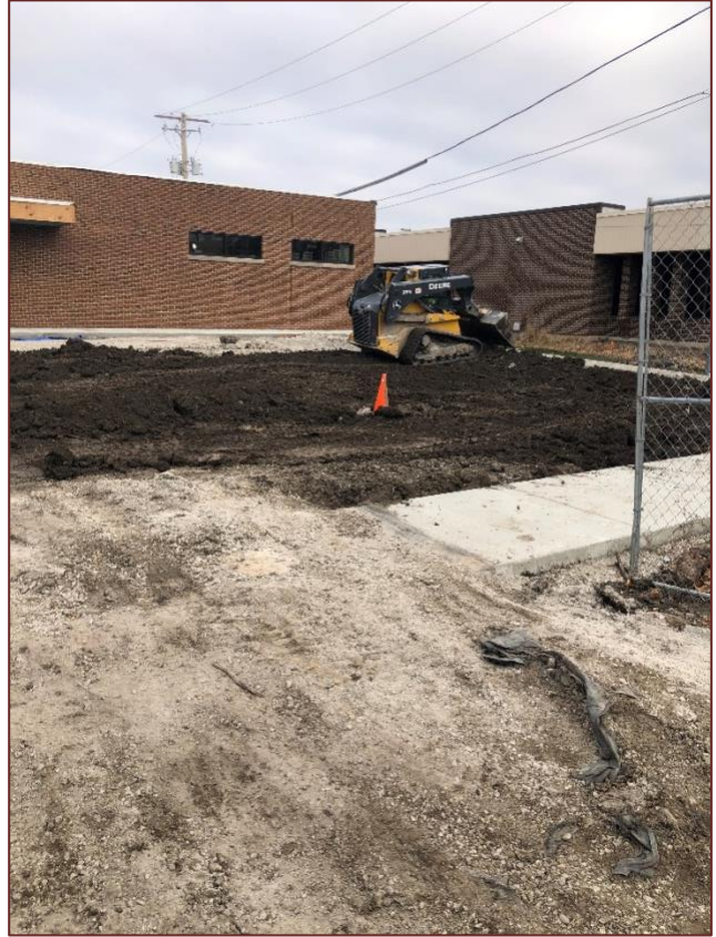
Working on the topsoil installation.