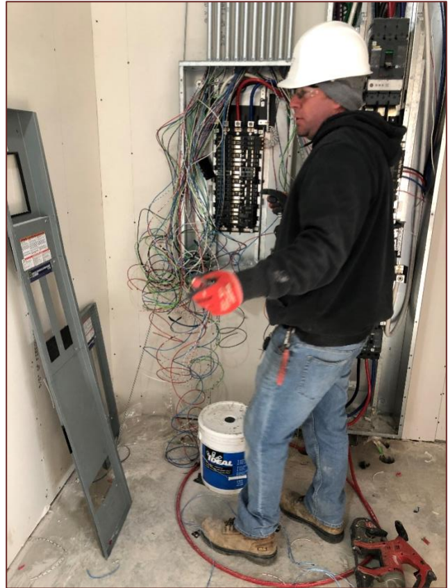
The first-floor circuit breaker box.