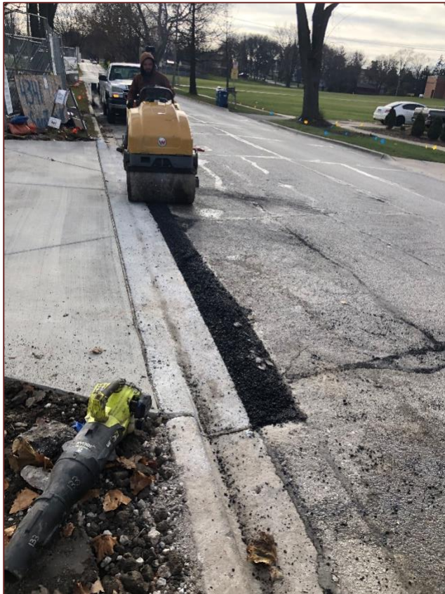
Asphalt paving this afternoon.