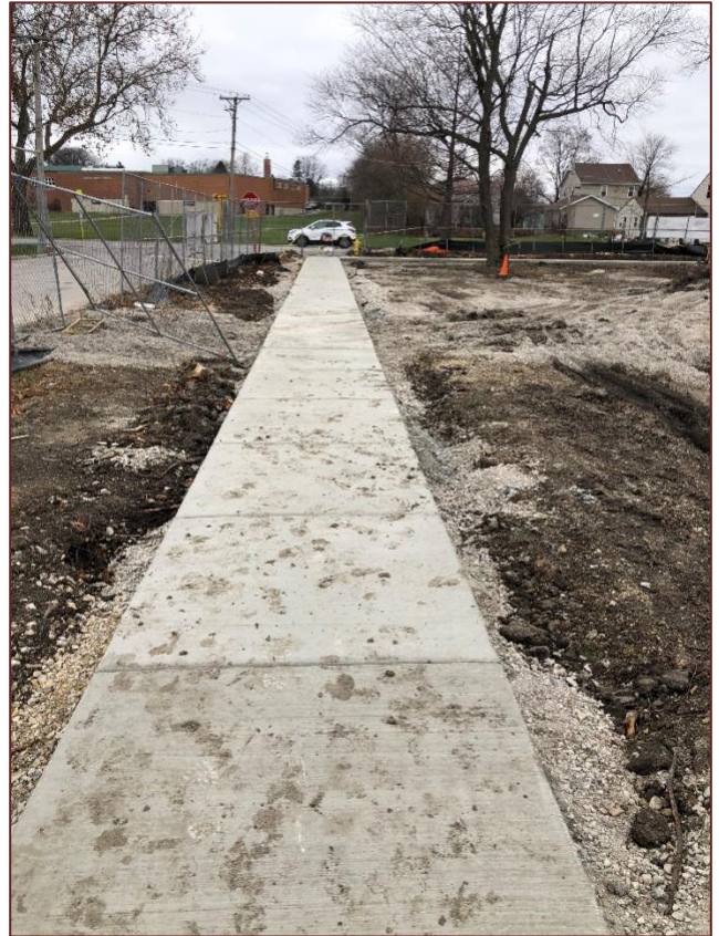
Com Ed connected to the pole over the weekend.