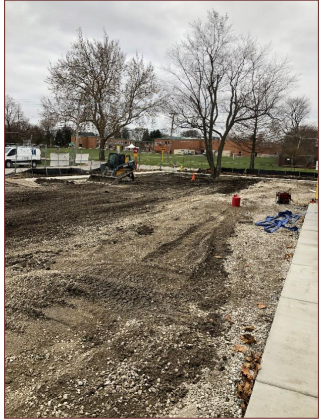
Cleaning up the backyard.