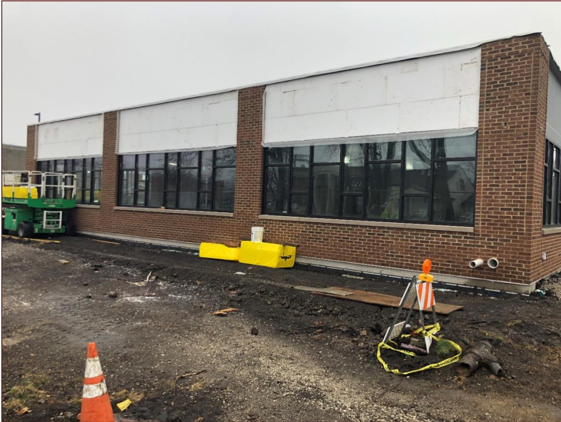
The west side.