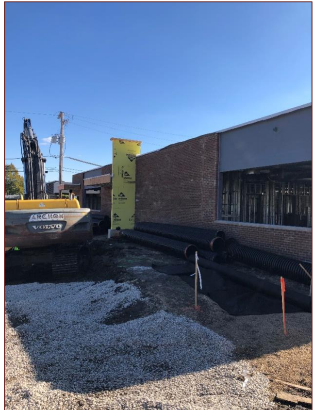
The brick work is complete.