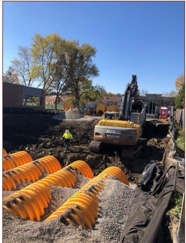
Excavation today and constructing the comp storage under the parking lot.