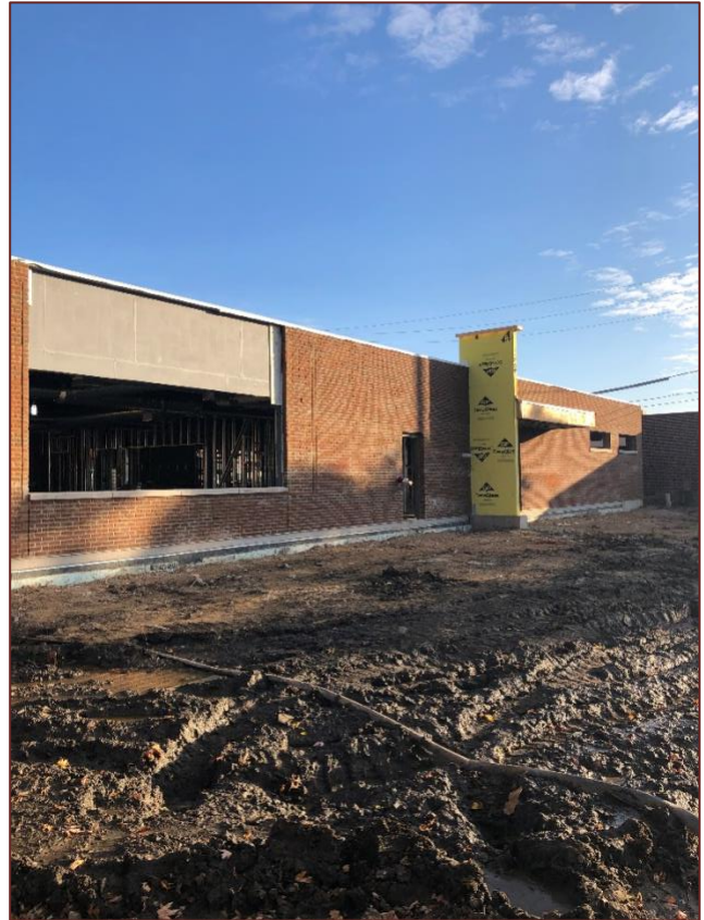
The brick work is complete.