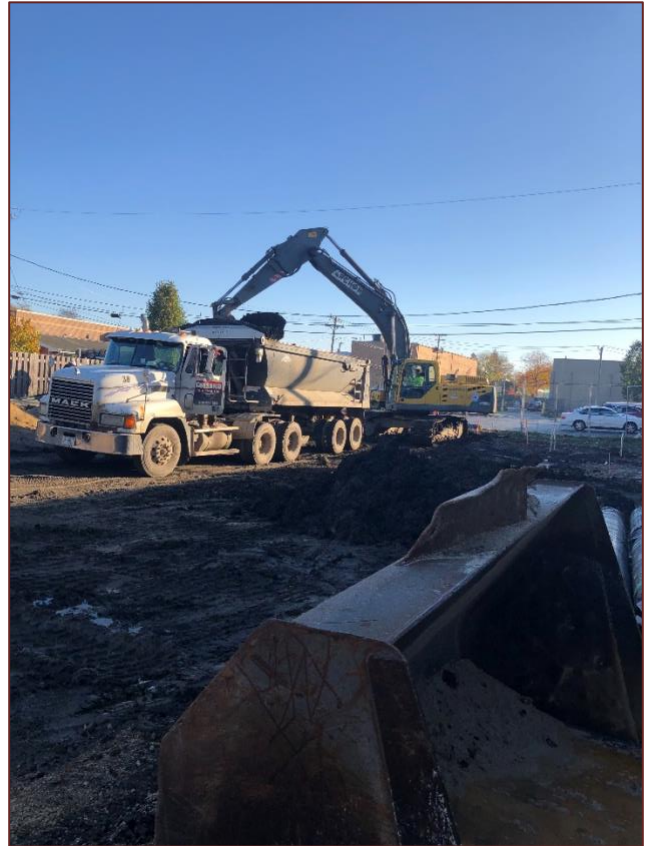
Excavation today under the parking lot for comp storage.