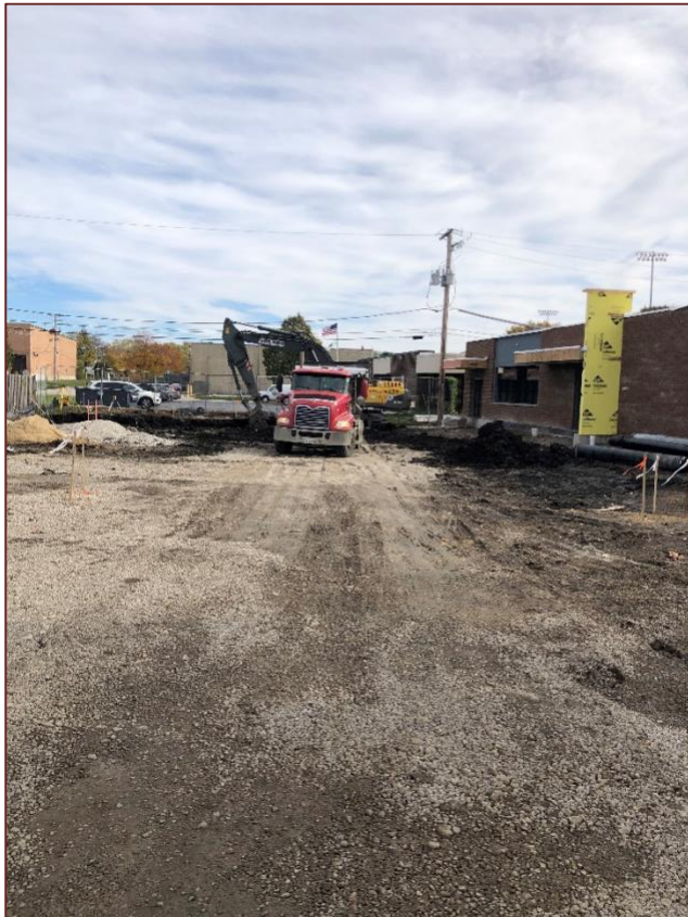
Excavation today under the parking lot for comp storage