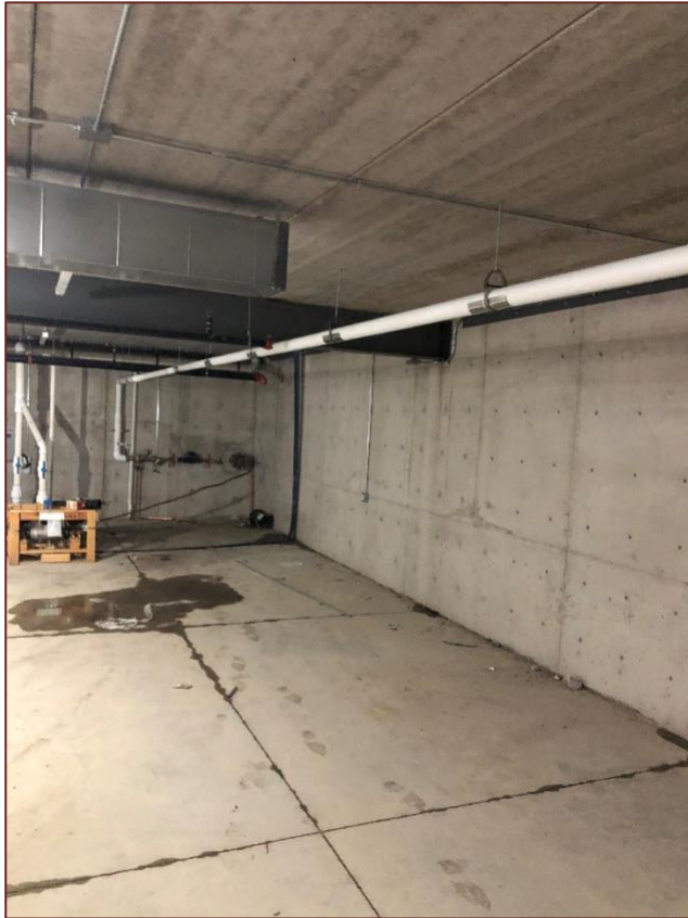
Wrapped water pipe.