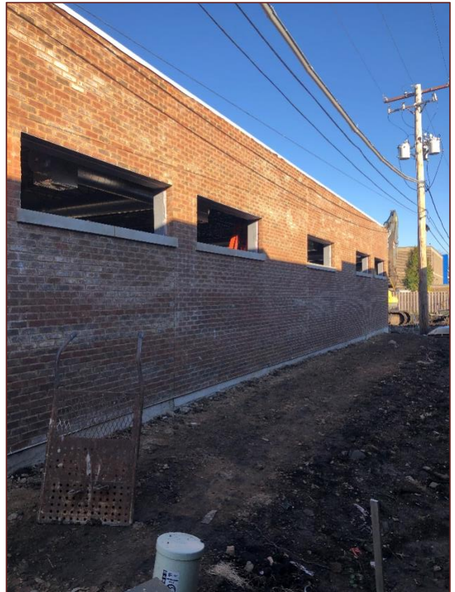
The brick work today.