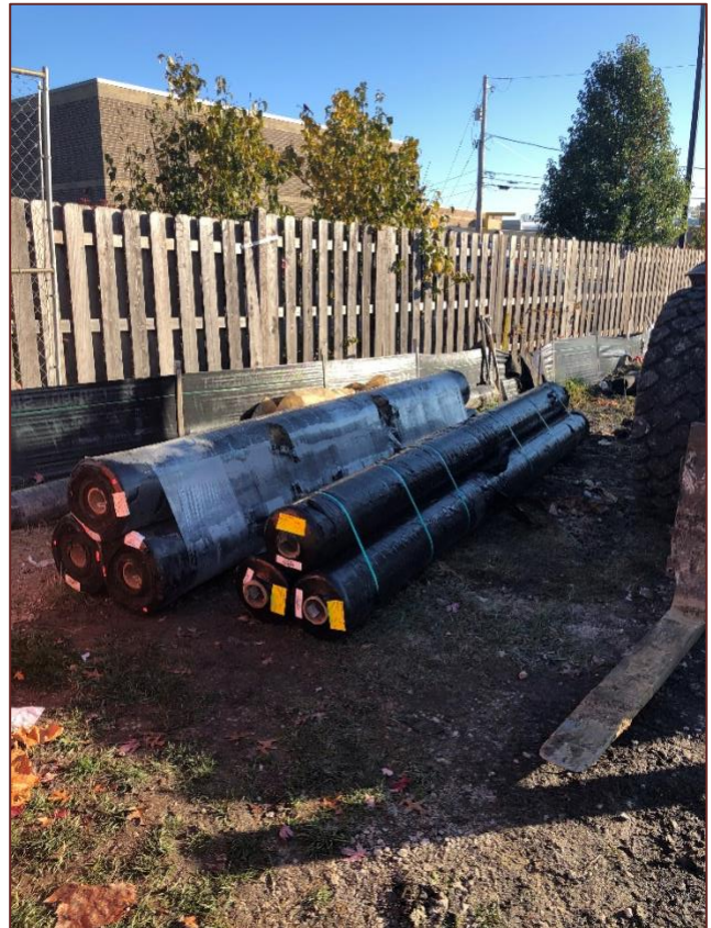
Fabrics for the comp storage under the parking lot.