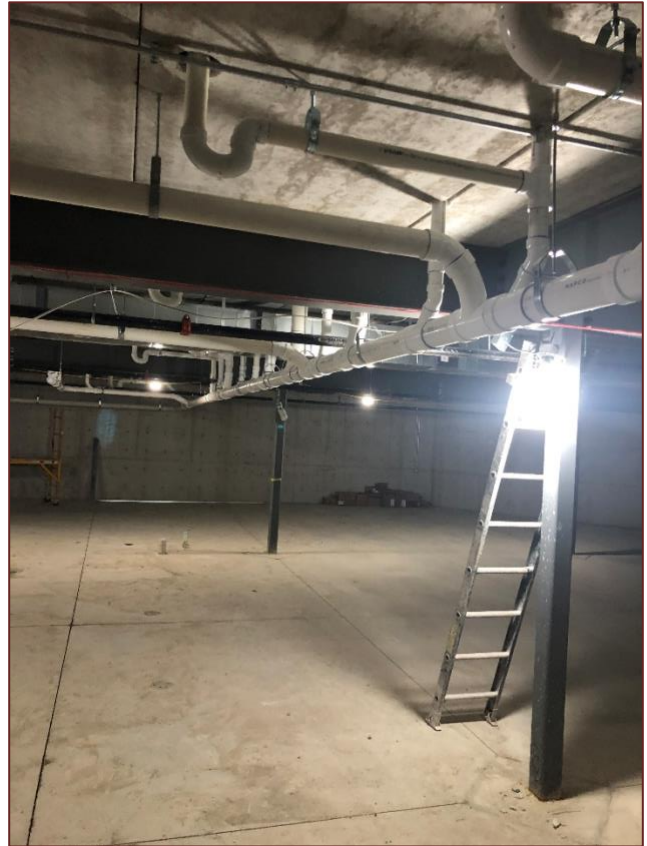
Plumbing for the bathrooms.