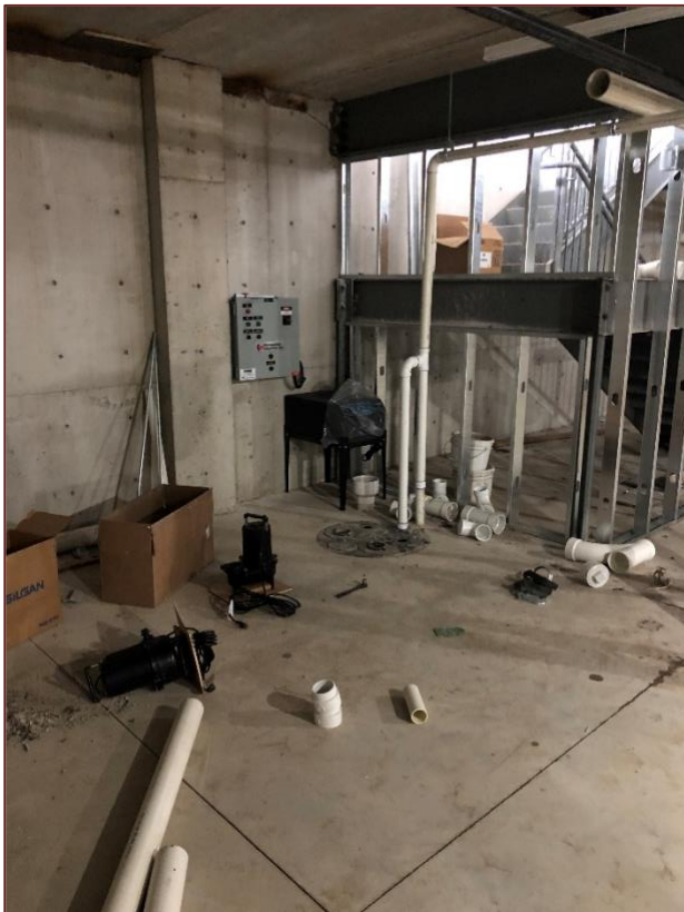
Plumbers work in the basement.