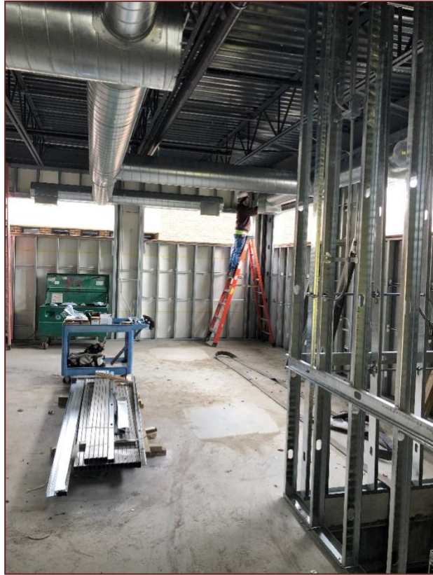
Electricians on first-floor.