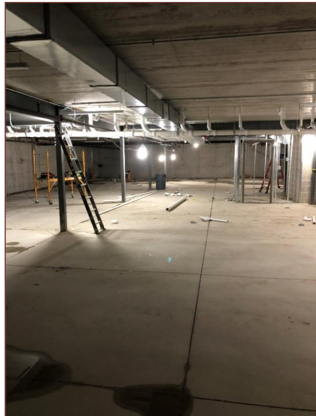
Work in the basement.