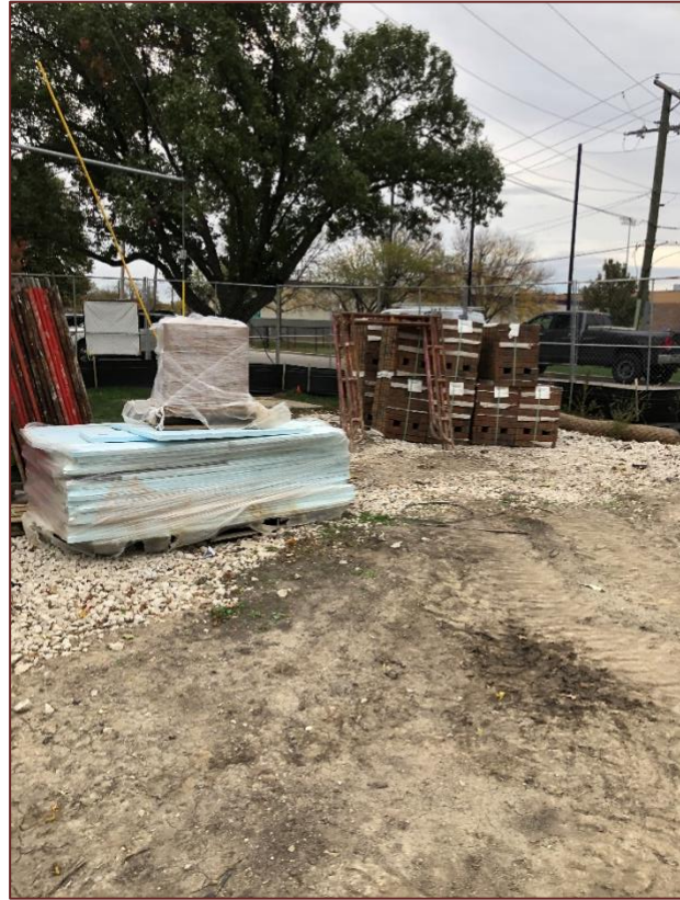
The masons are on-site.