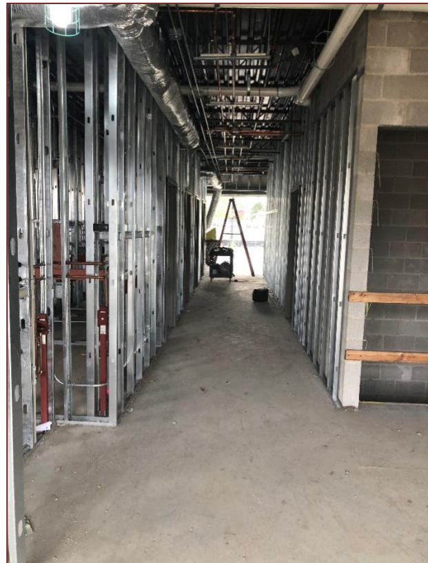
Working on the water service and the main hallway.