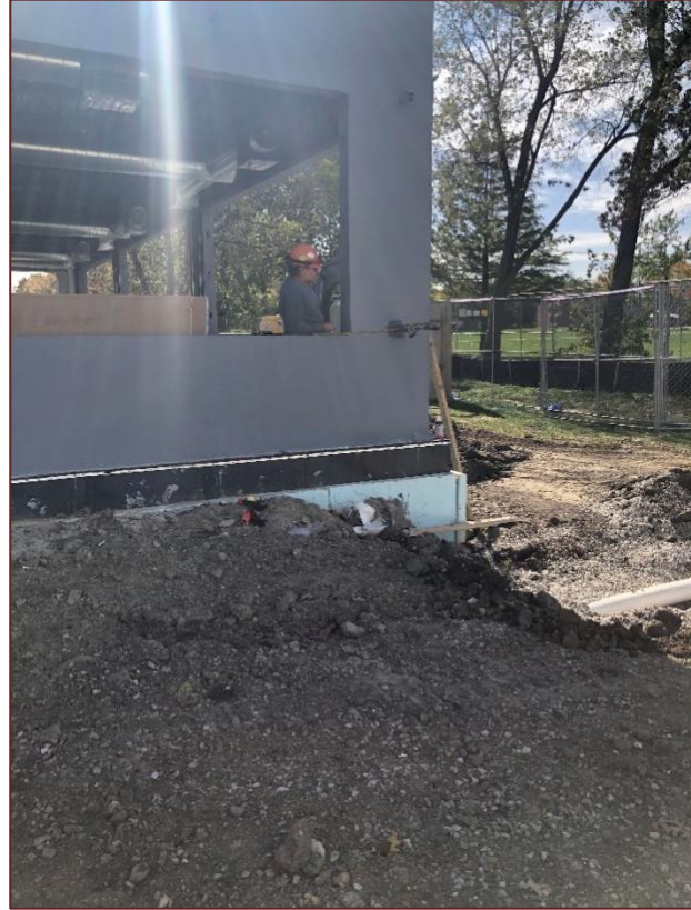
Working on the gas service and testing the gas piping.