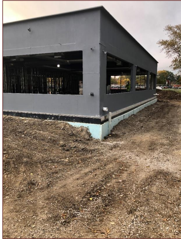
The north and west elevations.