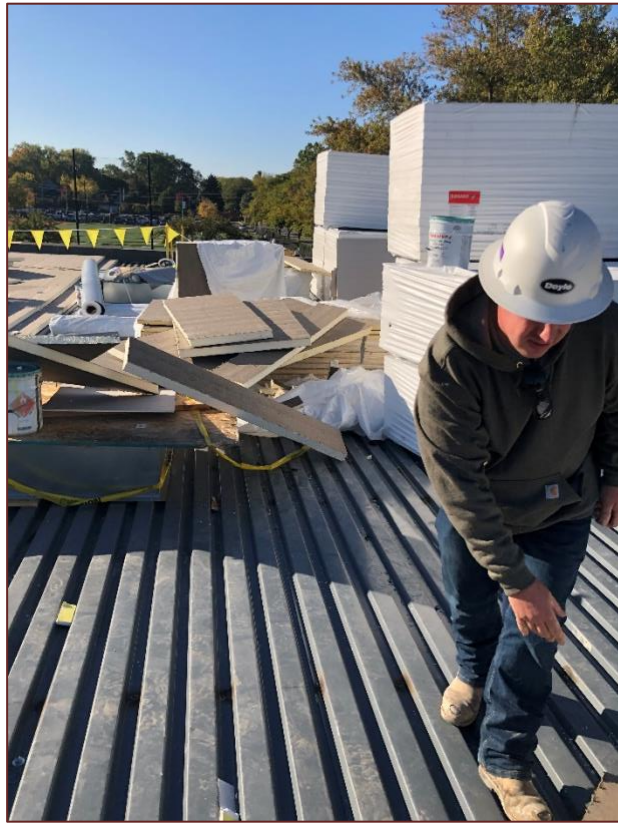
The roof work.