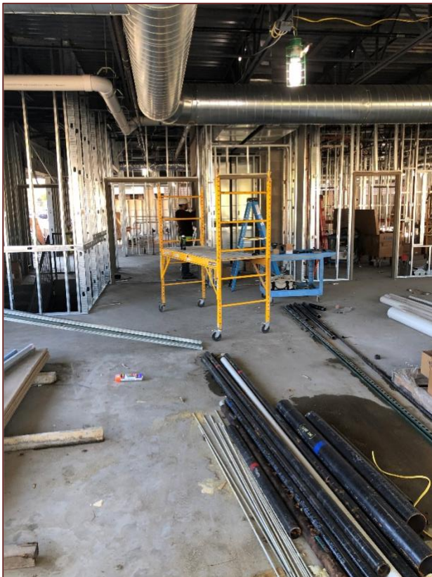
1 st floor.