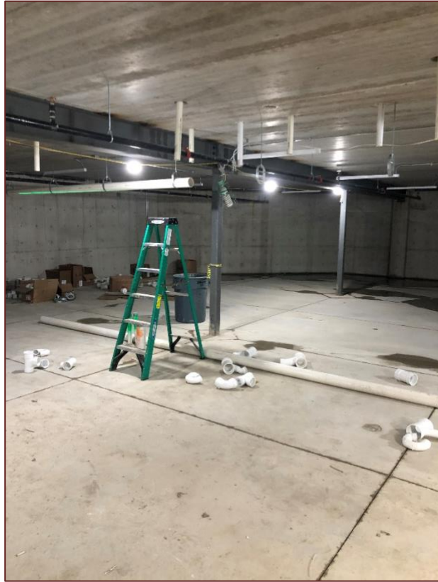
Basement sanitary pipe.