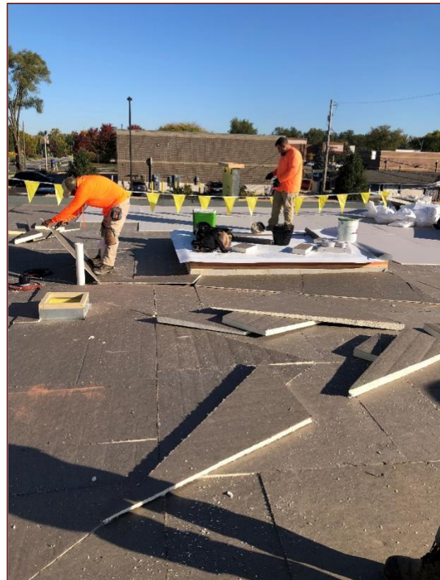
The roof work..