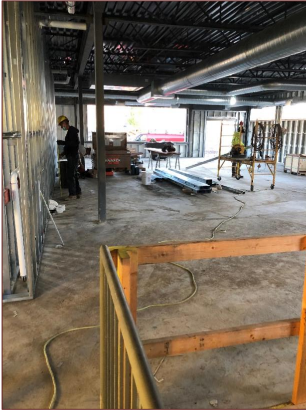
The working room.