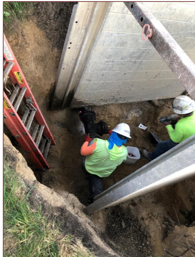
Connecting to the watermain.