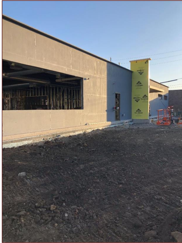
Starting the day.