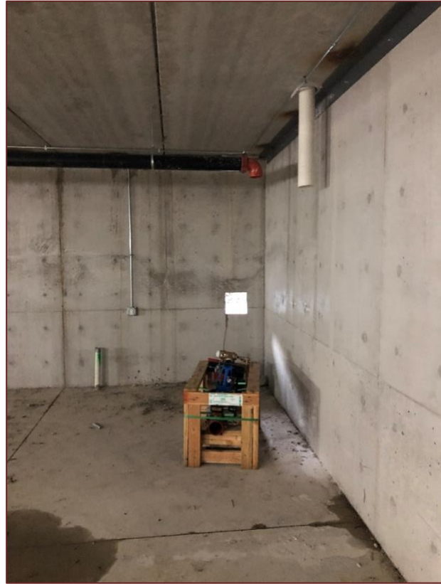
The water service entrance to building.