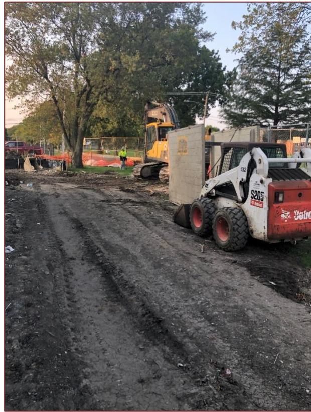
Starting the day.