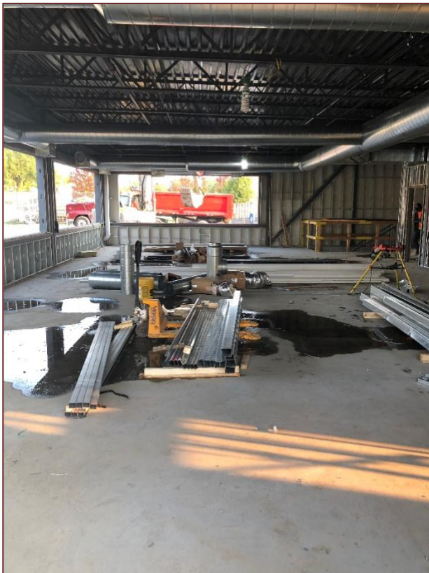
The community room.