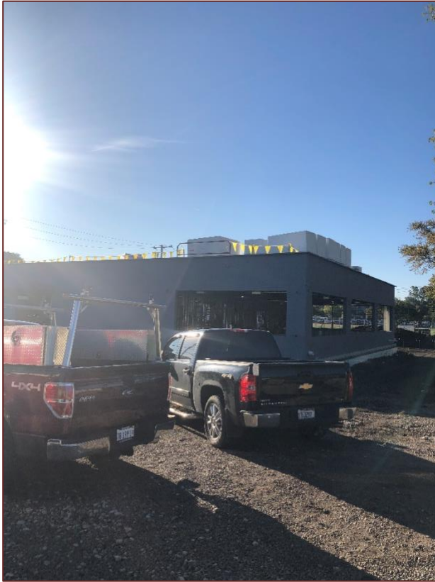
Entering the site.