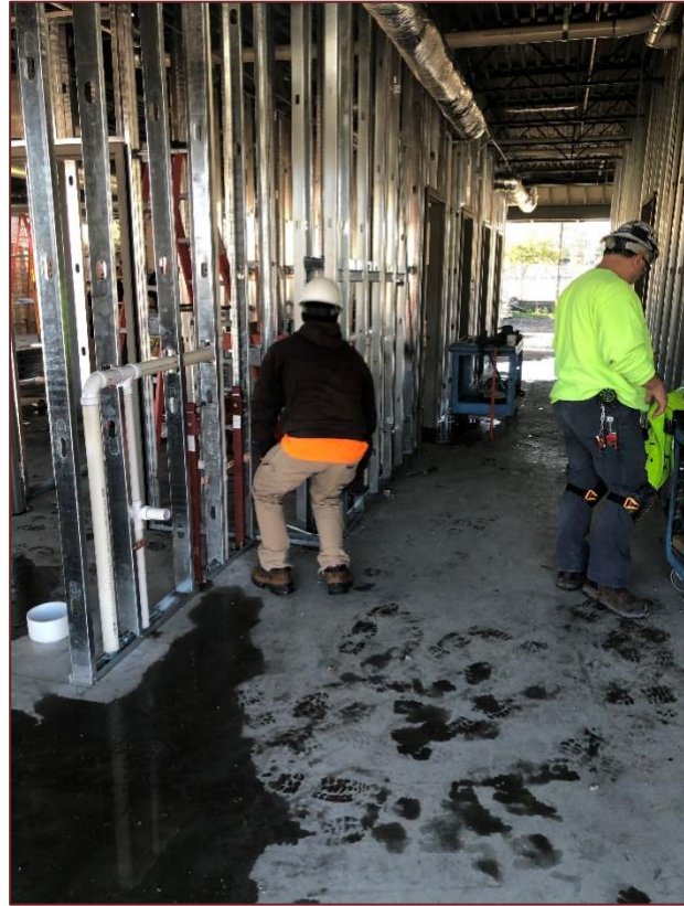
The carpenter's work.