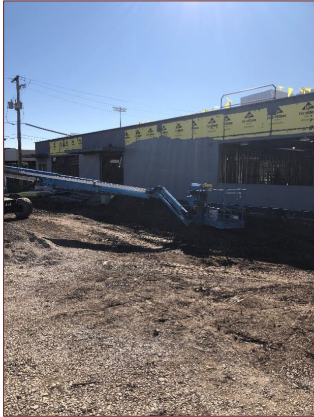
The north elevation.