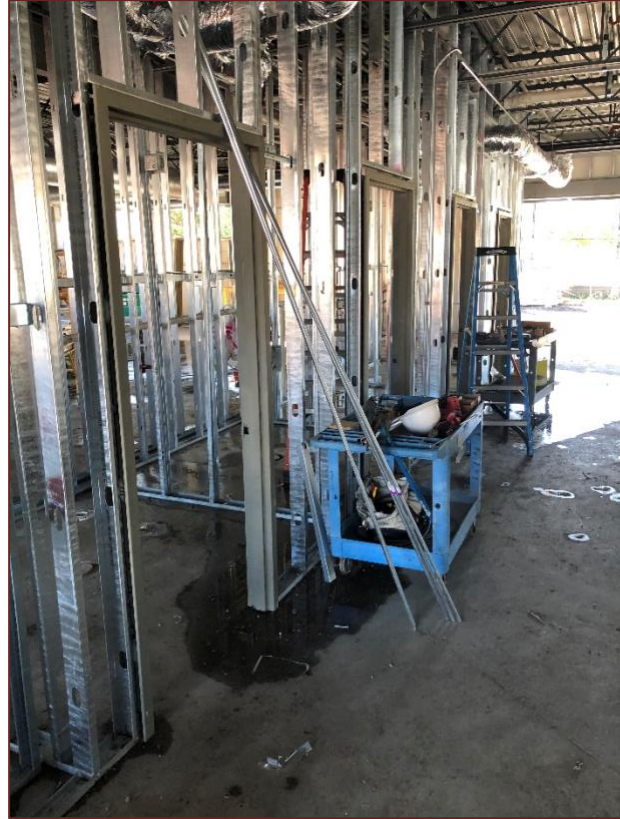
The door frames.