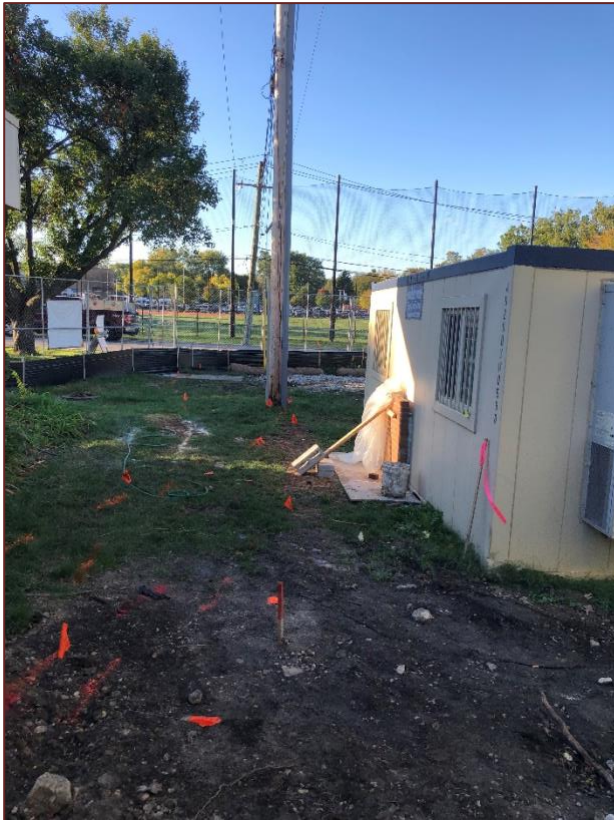
The new Com Ed pole location.