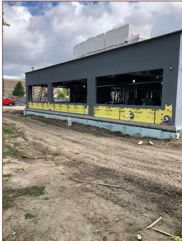
The west elevation