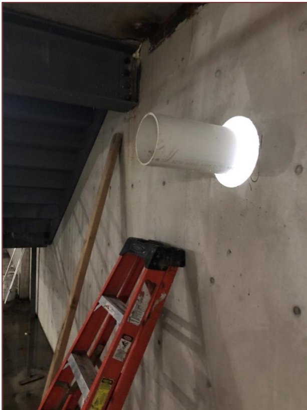
The sanitary sewer connection to the building.