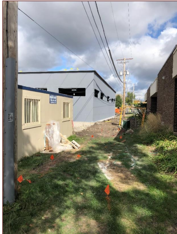
The east elevation.