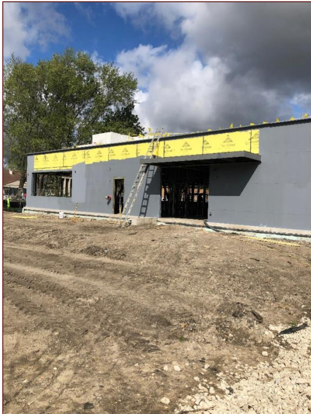
The south elevation.