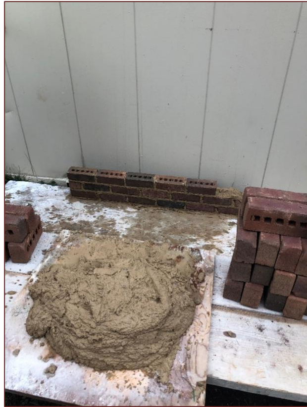
The brick mock up.