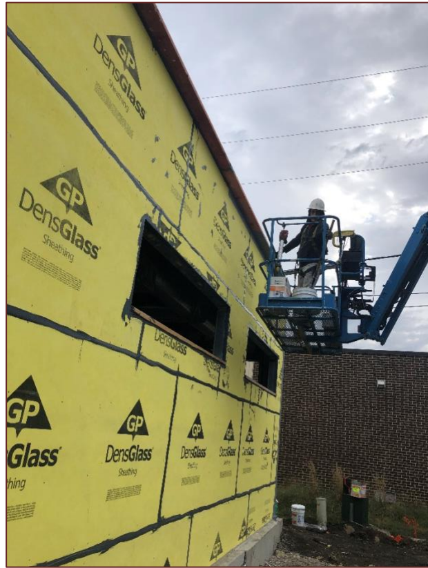
Work on the outside walls.