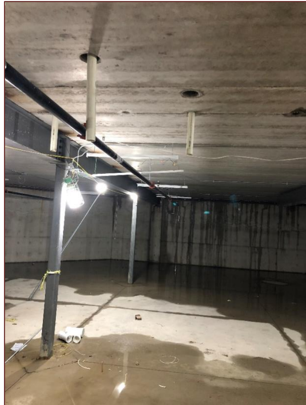
Electricians in the lower level.