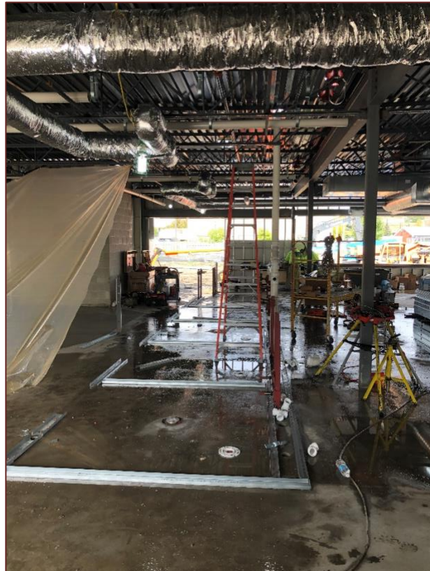
Finished concrete first floor.