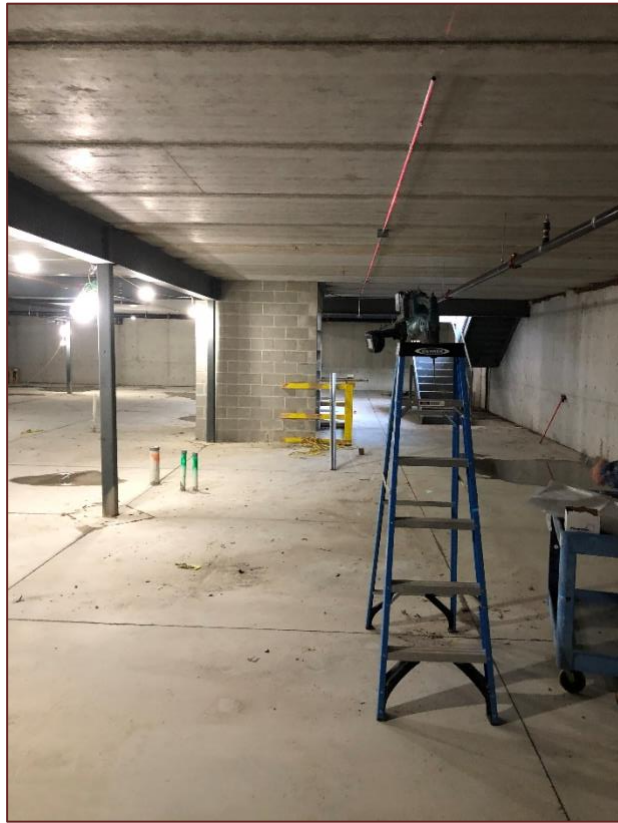
Electrical Installation in the basement.