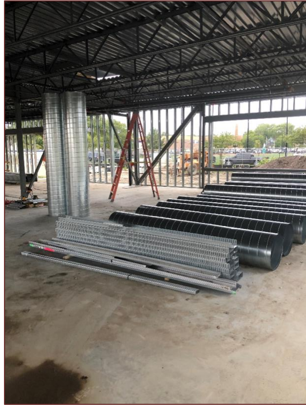
HVAC Materials on-site.