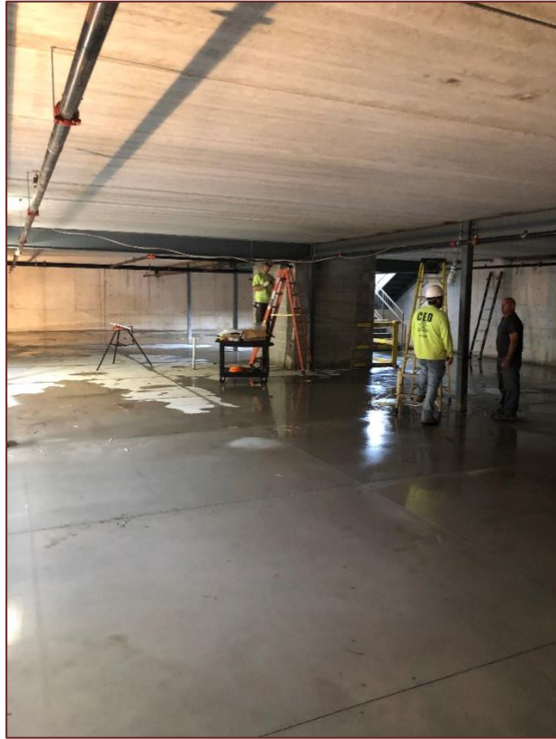
Fire Safety System install in the basement.