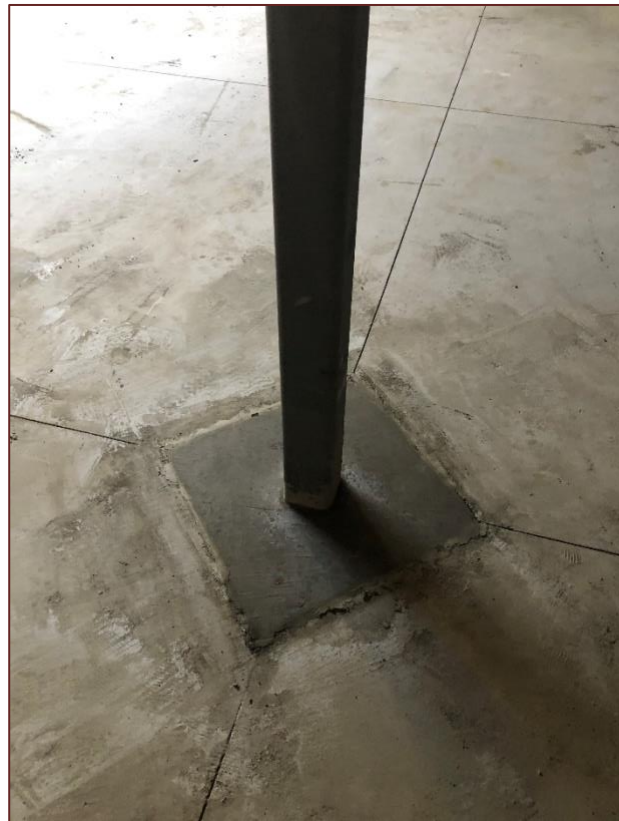
Downstairs and diamonds.