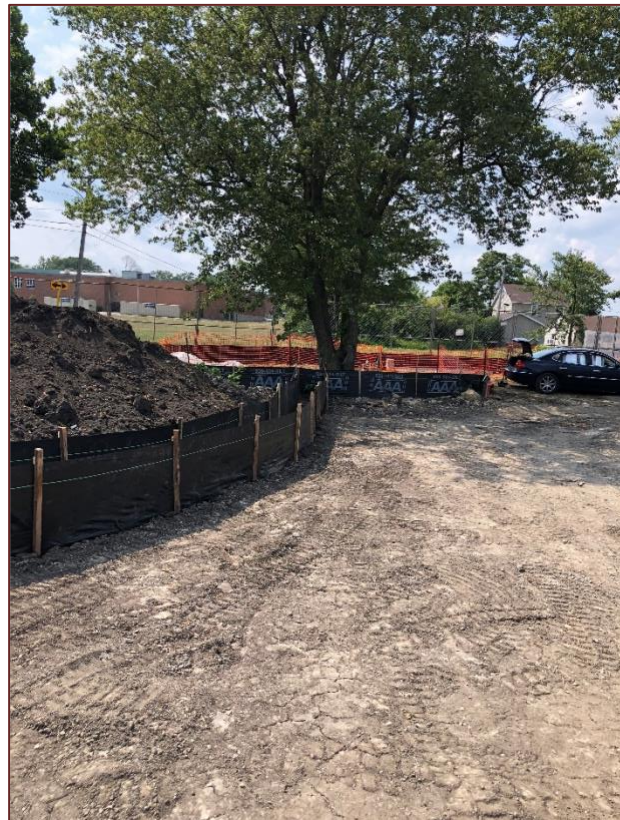
Refurbished silt fence.