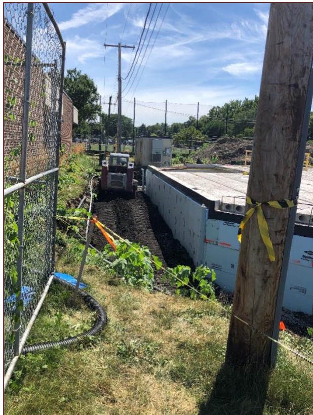
Backfilling the outside of the basement walls.