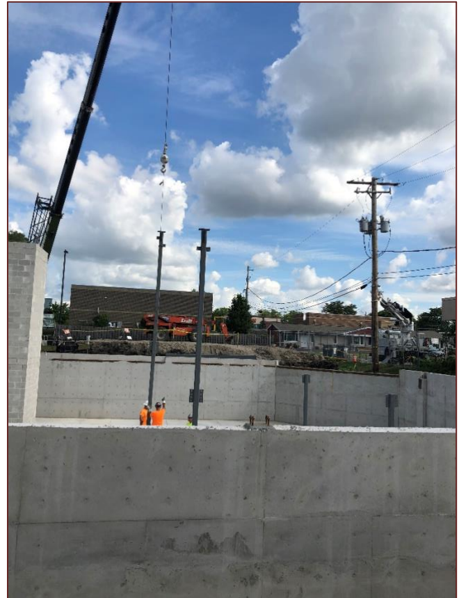
Setting the steel.