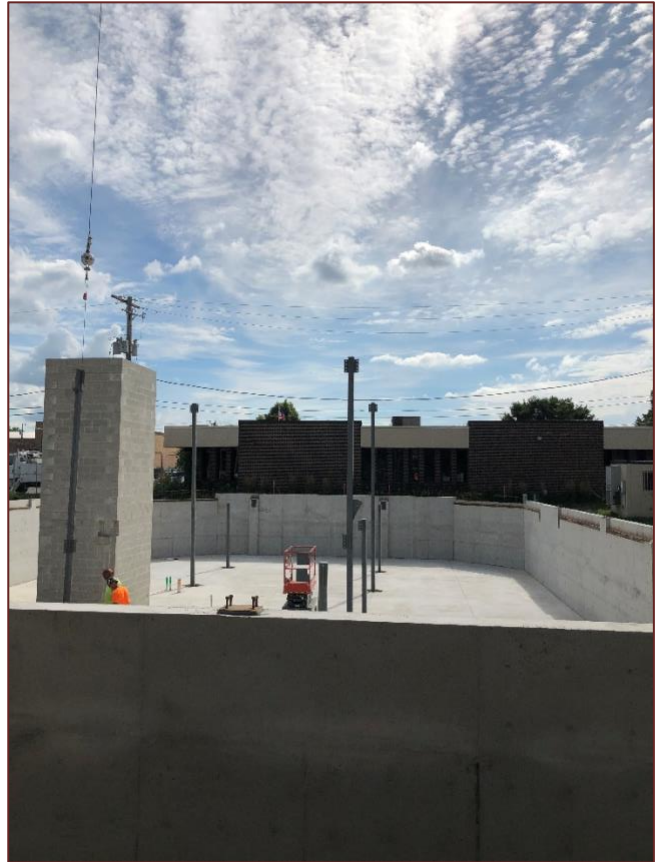
Setting the steel..