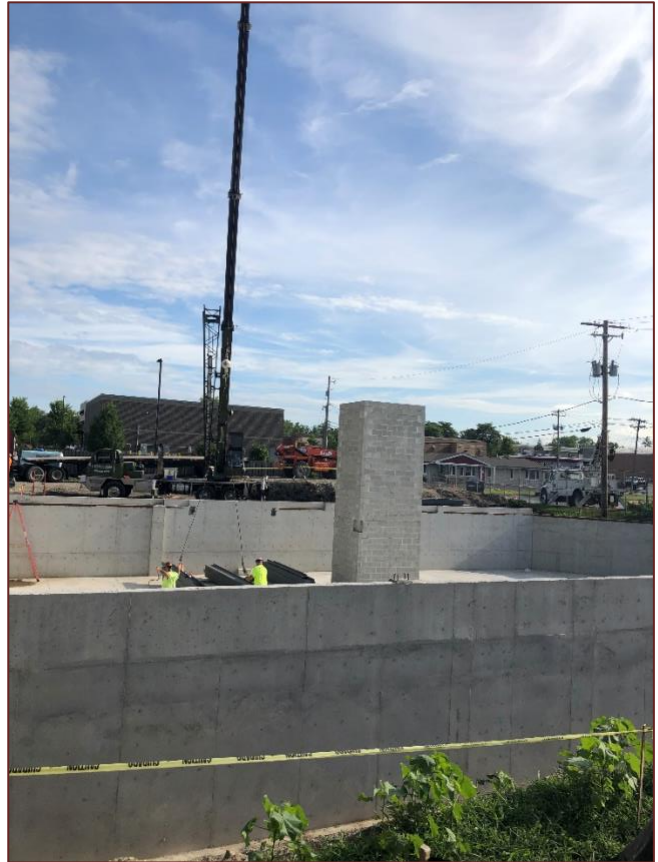
Setting the steel. .