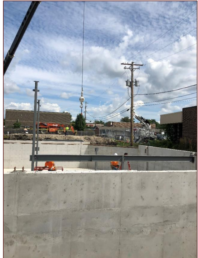
Setting the steel.