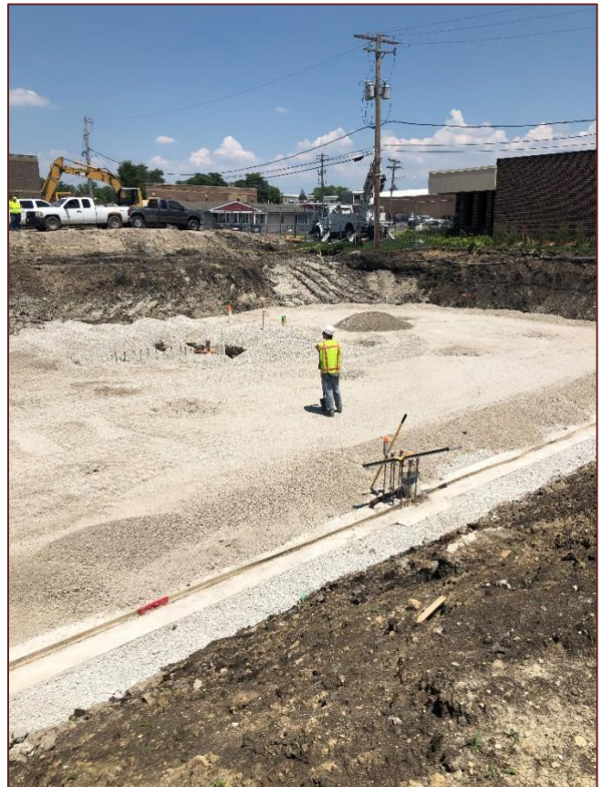
Completing the sub-base for the Basement.